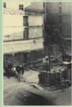
October 18, 1929