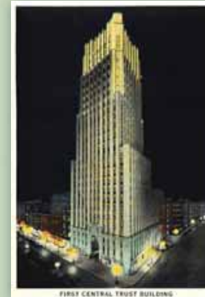
FIRST CENTRAL TRUST BUILDING

Better known today as the FirstMerit Tower, Akron's first skyscraper opened on July 23, 1931 to much acclaim. More than 40,000 visitors passed through the building on its opening day 75 years ago, and thousands more have worked and done business in the structure ever since. The building remains Downtown Akron's best known landmark even today.