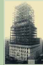
December 5, 1930