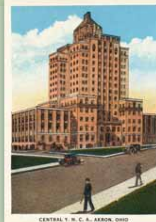
CENTRAL Y. W. C. A., AKRON, OHIO