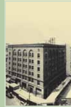
July 7, 1930