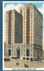
MAYFLOWER HOTEL 263 S. Main Street Akron, Ohio

Today, 75 years later, these venerable buildings stand as enduring signs of the city's former and future economic strength. The landmarks that transcended hard times still define the city's skyline and remain part of the architectural and historical backbone of the city.