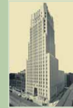
July 23, 1931