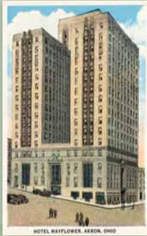
HOTEL MAYFLOWER, AKRON, OHIO

When the Mayflower Hotel opened May 18, 1931, it would become Akron's premier hotel for most of the 20th century. The 12-floor stately landmark at the corner of South Main and State Streets could accommodate 450 guests in luxury as well as providing an elegant setting for important banquets and countless high school proms. The renamed Mayflower Manor is now an apartment building.