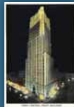
THE CENTRAL DEPOSITORS BANK & TRUST COMPANY 106 S. Main Street Akron, Ohio