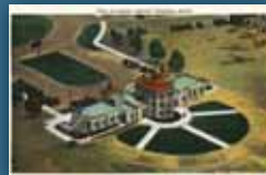
AKRON FULTON AIRPORT TERMINAL BUILDING 1436 Triplett Blvd. Akron, Ohio