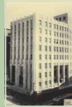
May 31, 1930