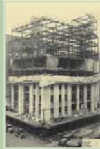
March 1, 1930