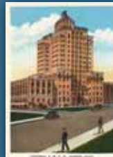
YOUNG MEN'S CHRISTIAN ASSOCIATION 80 West Center Street Akron, Ohio