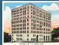
YOUNG WOMEN'S CHRISTIAN ASSOCIATION 146 S. High Street Akron, Ohio