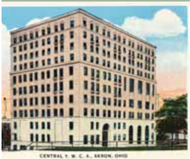
CENTRAL Y. W. C. A., AKRON, OHIO

The YWCA opened its sparkling new building in January, 1931 on the northwest corner of the High and Bowery Street intersection. The building was home to thousands of young women over the decades, as well as providing a setting for recreational and educational activities. The City of Akron Fire Department and Personnel Office now occupy the building along with an athletic club that still makes use of the beautiful original Art Deco swimming pool.