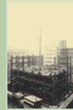
October 7, 1930